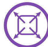
Purifies up to: 2,000 sq.ft.