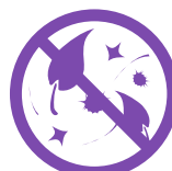
Helps reduce volatile organic compounds (VOCs)