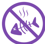
Helps reduce odors and chemical contaminants