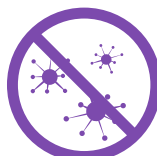
Helps reduce germs